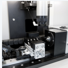
Laser Nozzle w. Product Axis